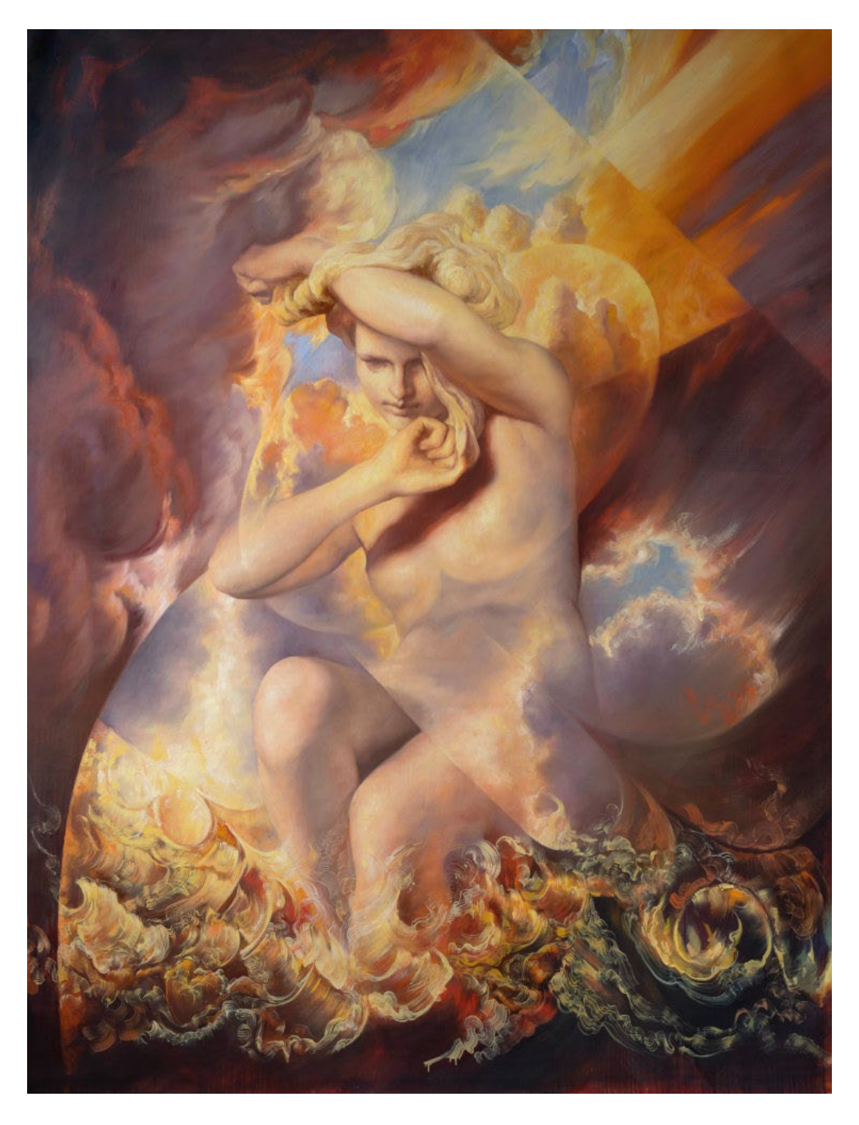
Oil on canvas 106 x 82 Inches 268 x 207 cm Sold