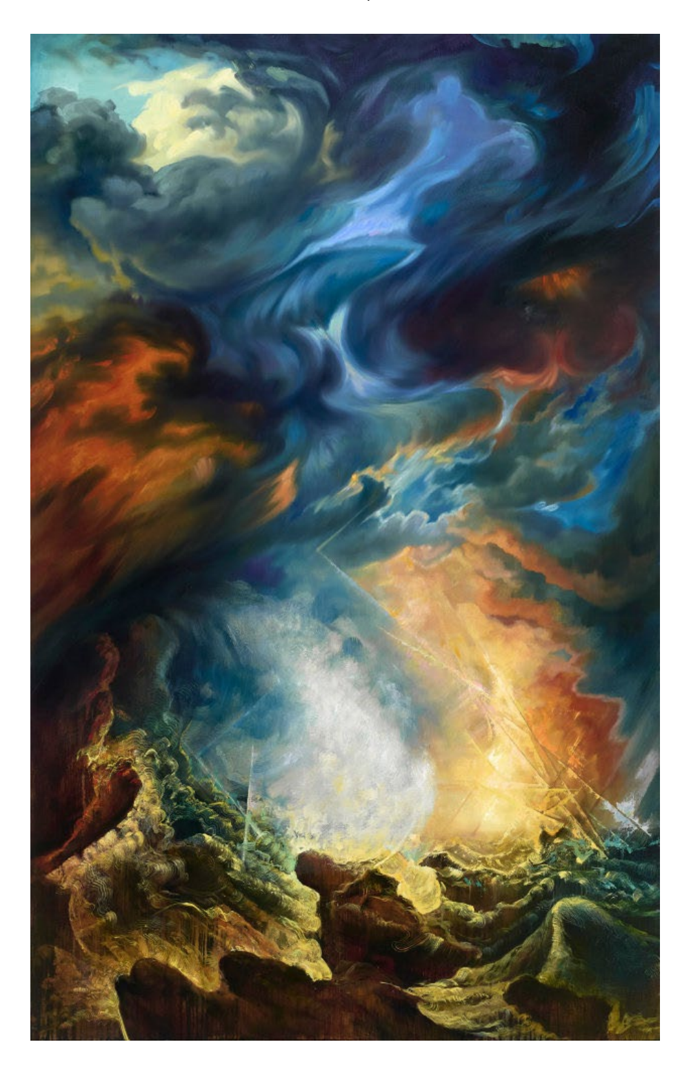
Oil on canvas 80 x 50 Inches 203 x 127 cm